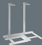
copy module stand (C4231A)

Three options which provide an efficient, cost-conscious means of controlling department output. The mailboxes are ideal in a shared environment, providing output assignment by department, workgroup or individual, for simplified job identification, separation and retrieval. The 5-bin mailbox provides stapling capabilities (up to 20 pages) and stacks up to 350 sheets in the stapling bin.