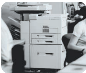
2000-sheet input tray (C4781A)

Floor-standing output device that stacks up to 3,000 sheets and provides automatic job offset capabilities for easy handling and job separation. The 3000-sheet stapler/stacker provides in-line multi-position stapling (up to 50 sheets) enabling the creation of a wide range of documents ready for distribution in just one step, right from your desktop.