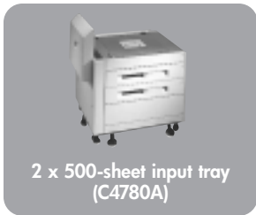
2 x 500-sheet input tray (C4780A)