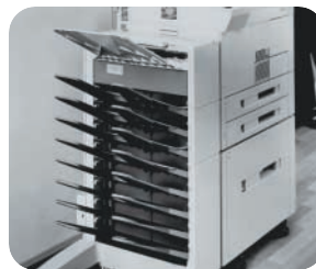
7-bin tabletop mailbox (C4783A)