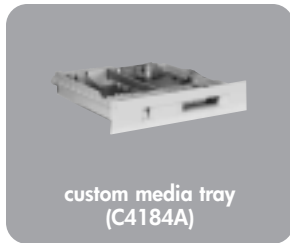
custom media tray (C4184A)